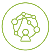
Exhibit your products and services in front of the most relevant industry players